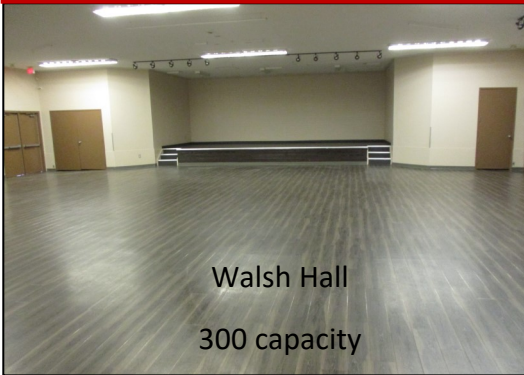
Walsh Hall 300 capacity

Bookings are very busy right now as people have rescheduled events that were postponed due to Covid-19. To arrange bookings and/or viewings call the office as soon as possible to avoid disappointment.