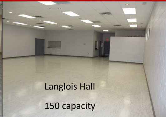
Langlois Hall 150 capacity