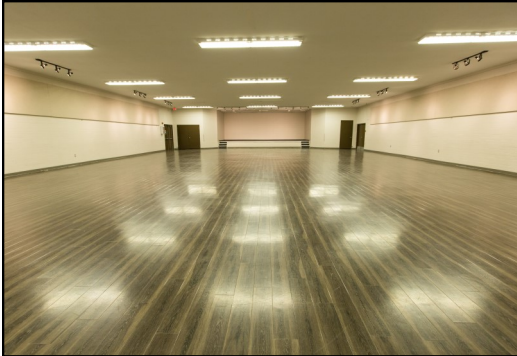
Walsh Hall : Capacity 300 people

Having a Party? Wedding? Christmas Party? Birthday Party? Bazaar? Banquet? Business Meetings/ seminars or training? Religious function?